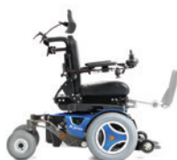
Flip up legrest 90°-150° (center mount)

Integrated UniTrack opens the door for an infinite number of adjustments and add on accessories