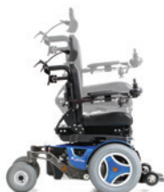
Seat elevator 0-200 mm