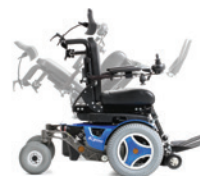
Seat tilt 0-45°