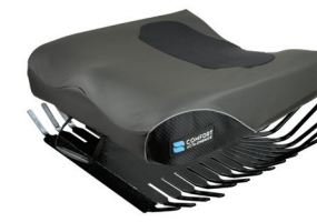
Comfort Embrace with ATI