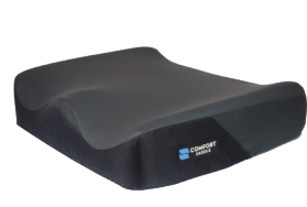
Comfort Saddle 7 Series