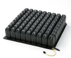
ROHO® Single Compartment