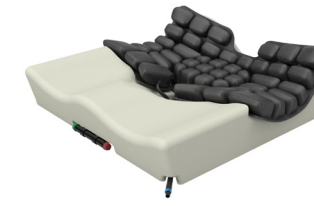
ROHO® Hybrid Select