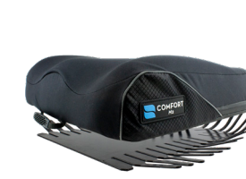
Comfort M2 with ATI