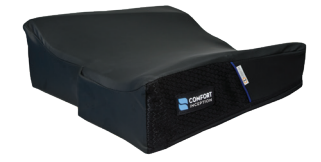
Comfort Custom Inception