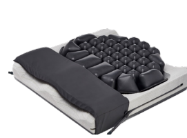
ROHO® HYBRID ELITE® Dual Compartment