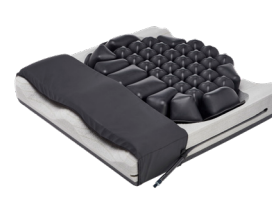
ROHO® Hybrid Elite SR® Single Compartment