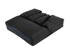
Vicair Vicair® Active O2