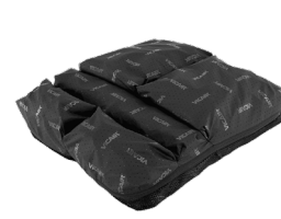
Vicair Vicair® Adjuster O2