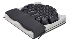
ROHO® HYBRID ELITE® Dual Compartment