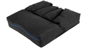
Vicair Vicair® Active O2