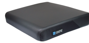
Comfort Support Pro 7 Series