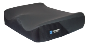
Comfort Saddle 7 Series