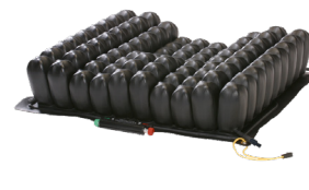
ROHO® CONTOUR SELECT®