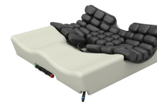
ROHO® Hybrid Select