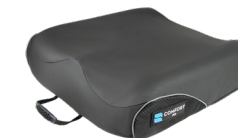
Comfort M2 Zero-Elevation M2 Anti-Thrust