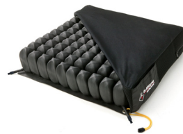
ROHO® Dual Compartment