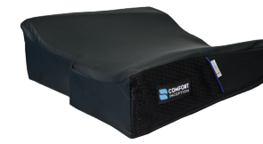
Comfort Custom Inception