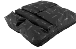
Vicair Vicair® Adjuster O2