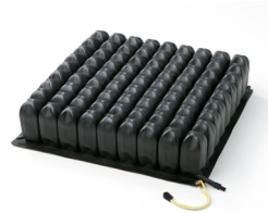
ROHO® Single Compartment