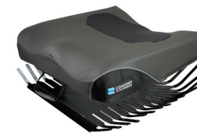
Comfort Embrace™ with ATI