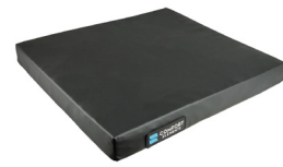
Comfort Elements® with Gel