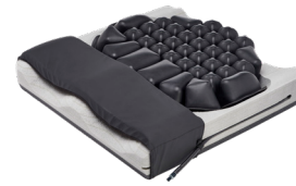
ROHO® Hybrid Elite SR® Single Compartment