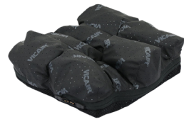
Vicair® Vicair® Junior Vector