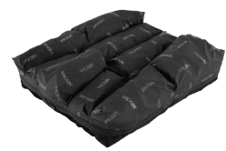
Vicair Vicair® Vector O2