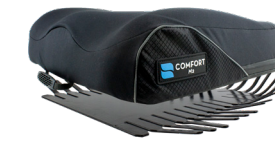
Comfort M2 with ATI