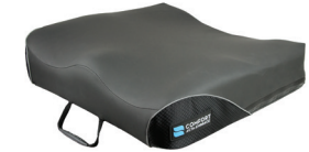
Comfort Embrace™ Zero-Elevation Embrace™ Anti-Thrust