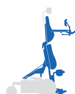
Anywhere in between

Ensure power standing wheelchair can be programmed with a standing sequence and specific angle that work for your body and your daily needs.