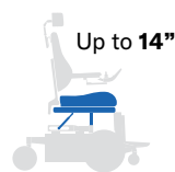
ActiveHeight (seat elevation)