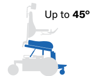
ActiveReach (anterior tilt)

Be aware that some power standing wheelchairs have limited power seat functions which could compromise your daily routines.