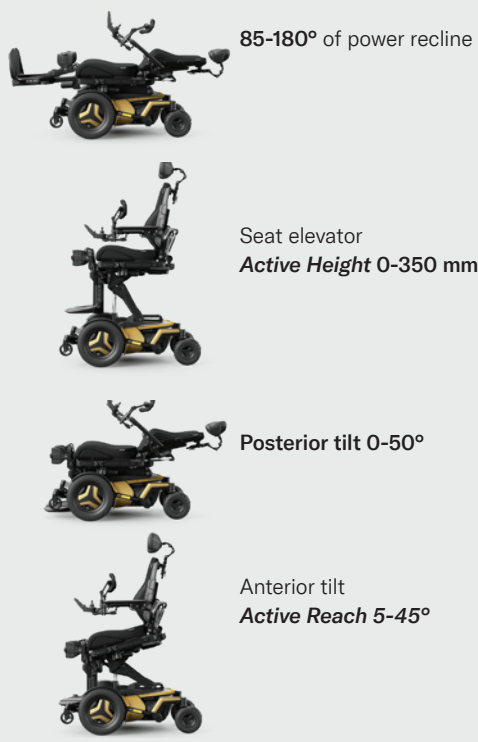
85-180° of power recline