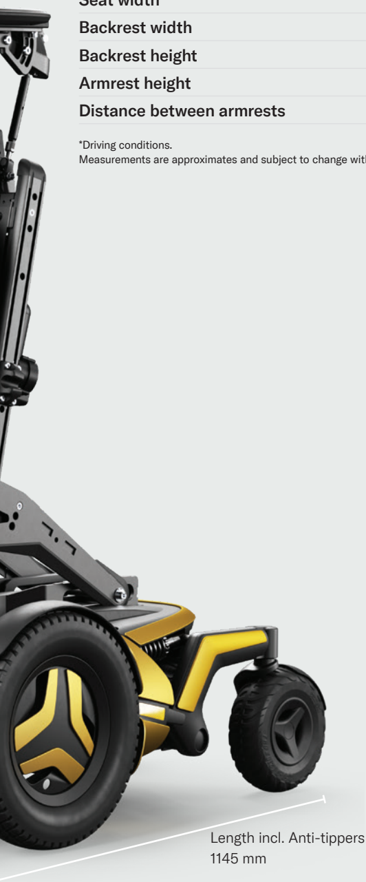
Length incl. Anti-tippers 1145 mm