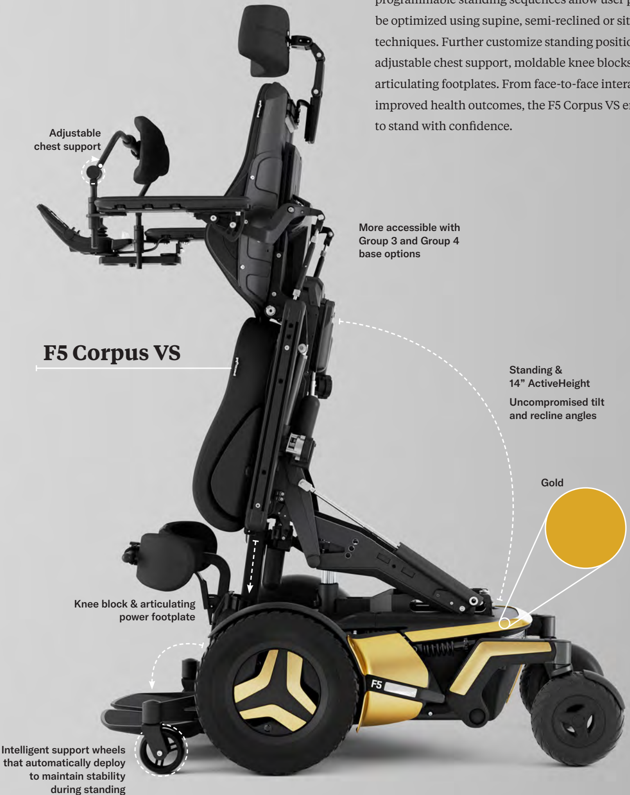
F5 Corpus VS

We combined all of the performance features of the F5 Corpus with superior power standing functionality. Fully programmable standing sequences allow user position to be optimized using supine, semi-reclined or sit-to-stand techniques. Further customize standing positions with adjustable chest support, moldable knee blocks and power articulating footplates. From face-to-face interactions to improved health outcomes, the F5 Corpus VS empowers you to stand with confidence.